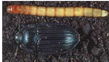
False Wireworm Family: Tenebrionidae