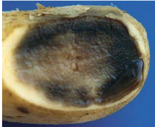
Online picture-Pythium Leak

The growing season is starting to wind down. Harvest is underway and storage season is just around the corner. To reduce storage rots, when possible, try to avoid digging wet potatoes, avoid digging if temperatures are extremely hot or cold, allow skin to set before harvesting, and dig in a way that causes the least amount of tuber damage. Tubers stored wet can quickly develop into bacterial soft rot and even Pythium Leak. Damaged tubers can often result in Fusarium dry rot as well as bacterial soft rot. The lab has been receiving the occasional zebra chip symptomatic tubers.