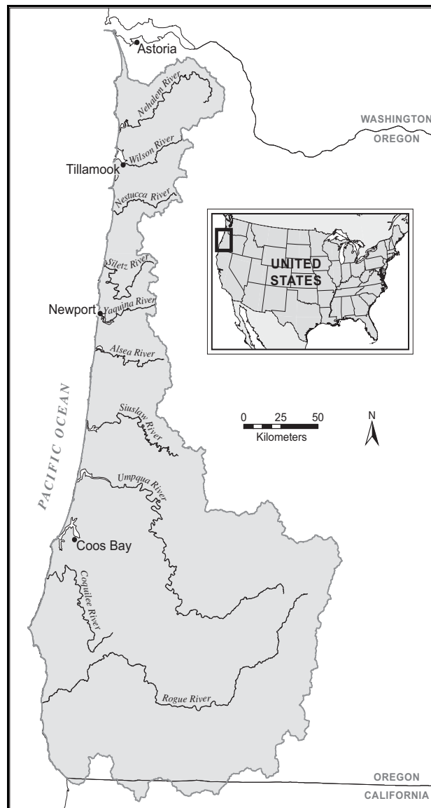
Figure 1. Oregon coastal watersheds considered in this study.