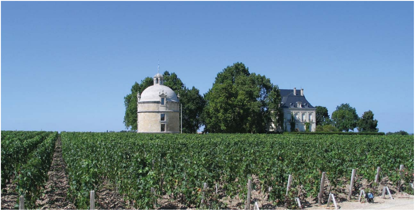
Built in the 14th century, destroyed in the 15th, then rebuilt in the 17th, the tower of Chateau Latour in the Bordeaux region of France is one of the world's most recognizable landmarks associated with the rich history and longevity of fine red wine.

In a similar way, red wine contains many components that influence our ability to perceive tannins. The short list of compounds includes organic acids, simple sugars (generally too low in concentration to influence astringency), ethanol, polysaccharides, and anthocyanins. These all combine to modify astringency perception. As many winemakers describe the effect, it is much like flesh covering a skeleton. The tannins provide the structure and support of the red wine, and the other components provide the flesh and appeal.