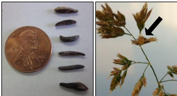
Figure 2. Ergot sclerotia (left) and honeydew (right, indicated by an arrow).