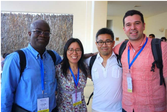
Former students meet up with their professors, now colleagues, at NAAFE, like this University of British Columbia group