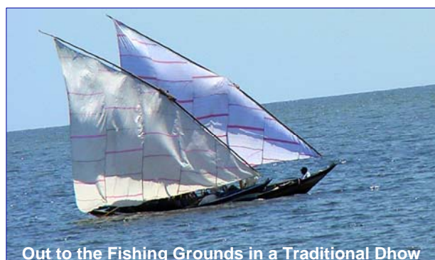
Out to the Fishing Grounds in a Traditional Dhow

The International Institute of Fisheries Economics & Trade is delighted to announce the site of our sixteenth biennial conference: Dar es Salaam, Tanzania! With its marine and inland waters including the riparian shared waters of East Africa's great lakes (Lake Victoria, Tanganyika and Nyasa), Tanzania offers a fresh view of the many opportunities and challenges to tantalize economists, fisheries managers, industry members, and representatives of international organizations from all over the world. We hope that this next IIFET destination will provide fertile ground for the development of new areas of collaboration, understanding, and exchange on the economics of fisheries management, aquaculture development, seafood trade and related topics.