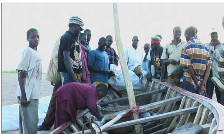
Top Left: (Introduced) Nile Perch from Lake Victoria: big fish, big money, big environmental tradeoff