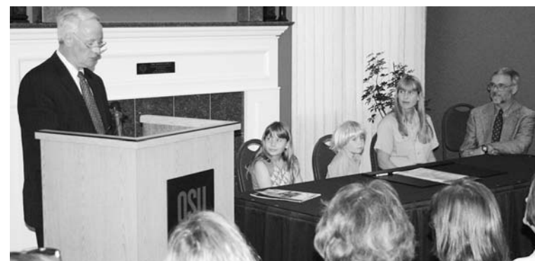
"I am so proud to be developing a partnership with the OSU for important research to conserve whales," Terri Irwin said at the signing on June 25.

For more information about the campaign, visit http://campaignforosu.org/ .