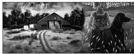
More than 130 artists are included in the exhibit.

July 17-"Sustainable Buildings - The Contribution of Timber Structures," Werner Seim, Richardson Hall 115, 10 a.m.